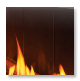
Included with the U30, U50, and U70