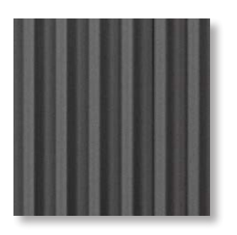
Compatible with the U30, U50, and U70