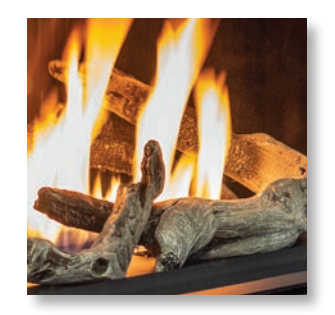
Compatible with the U30, U50, and U70