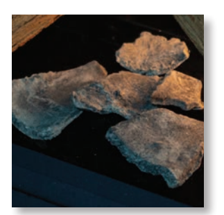
Compatible with the U30, U50, and U70