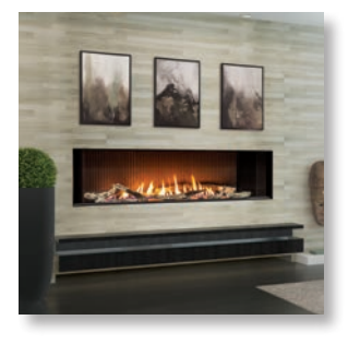
Compatible with the U50, and U70