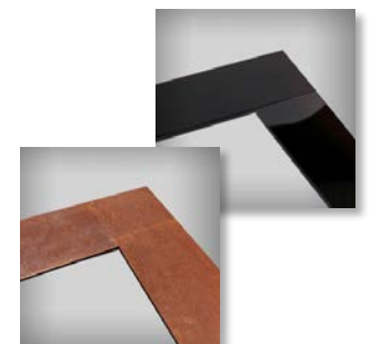
Compatible with the U30, U50, and U70