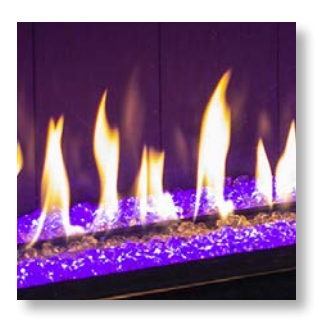
Compatible with the U30, U50, and U70