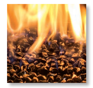
Compatible with the U30, U50, and U70