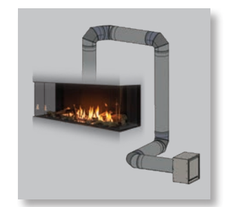
Compatible with the U30, U50, and U70