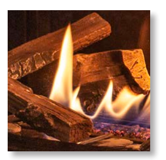
Compatible with the U30, U50, and U70