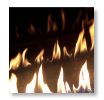
Compatible with the U30, U50, and U70