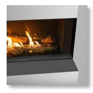
Compatible with the U30, U50, and U70